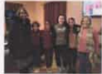
The dancers after rehearsal

For the Christmas show this year, two of our alumni girls who are still active in dancing worked with two of our younger student girls to prepare a dance presentation celebrating the glory of God at the birth of Jesus Christ.