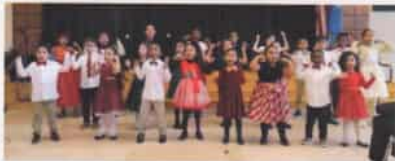
"There is Power in the Blood"

Thank you for your support of the school. Blessings at Christmas.