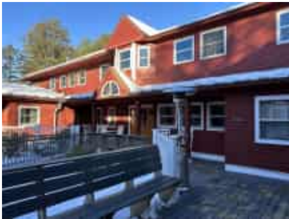
The Conference Center at Calumet.