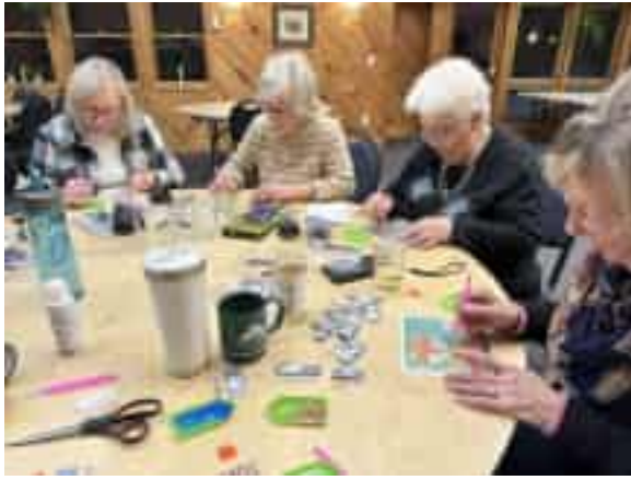
Creating masterpieces using Diamond Art.