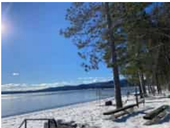
We enjoyed a walk by the beach.