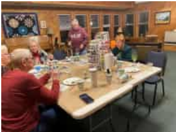
Painting wine glasses in the Micah Room. We also gather here each evening for movies.