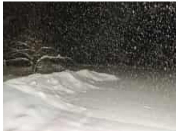
We were greeted by snow on our first evening.