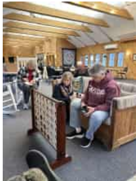
Playing Connect Four by the fireplace.