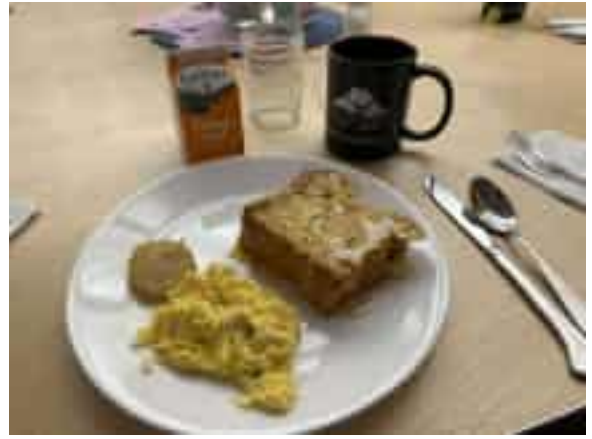
A beautiful piece of French toast. Breakfast is always amazing!