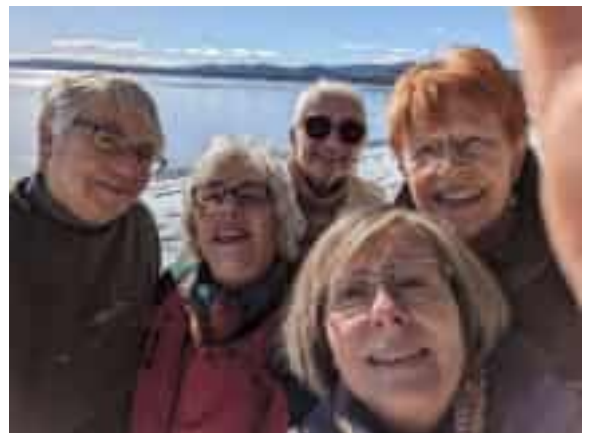
A selfie by the lake.